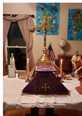
Home Altars in the Nicholville, NY area!