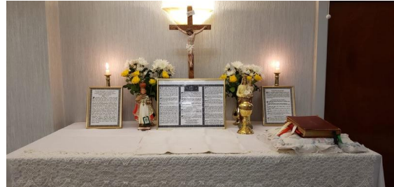
And in St. Catharines, Ontario!