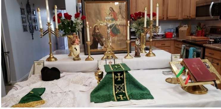
Makeshift altar near the kitchen in Phoenix, AZ!