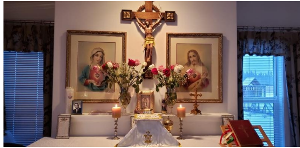
Beautiful altar above the fireplace in Bay Tree, Alberta, Canada.