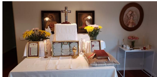
Makeshift altar 'Down Under' in Australia!