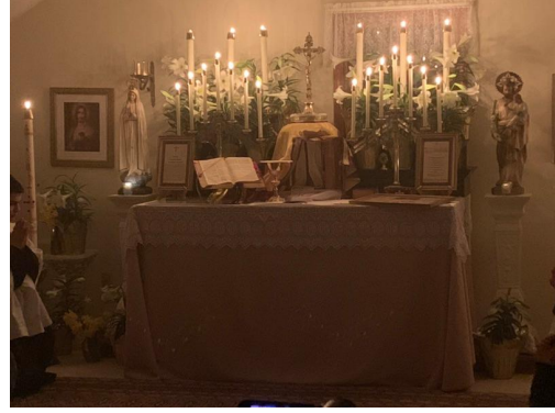
Candlelight Easter Midnight Mass!