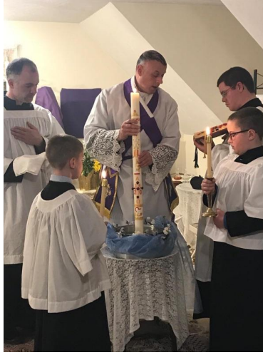
Blessing of the Baptismal Water during the Church's Easter Vigil ceremonies.