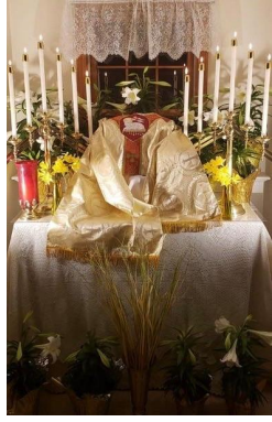
Altar of Repose for Holy Thursday