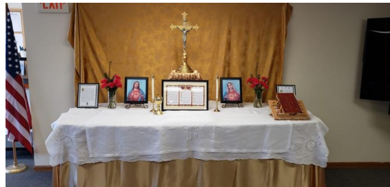
Above, lovely 'makeshift' altars for the Ambulance Hall in the Sparta, NJ area. Below, the basement Chapel Altar at the Tannersville, PA chapel.