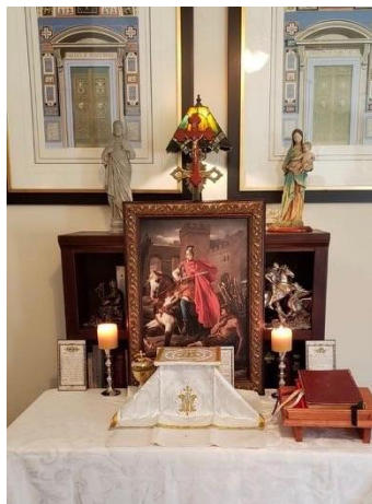
The impressive image of St. Martin of Tour adorns this home Altar in Raleigh, NC!