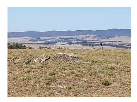
Notice anything interesting in this picture? Take a closer look -->