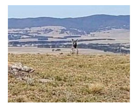
At the edge of the hill, a kangaroo curiously pops up to see what all the commotion is about!