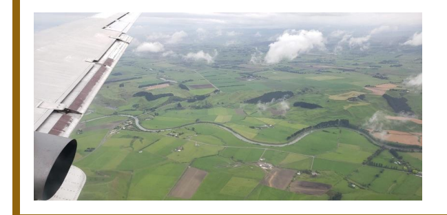
Aerial view of a part of New Zealand. If you look closely, you might see Hobbits wandering amongst the hills!