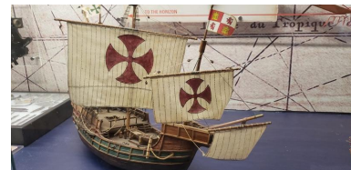
Replica of Spanish ships