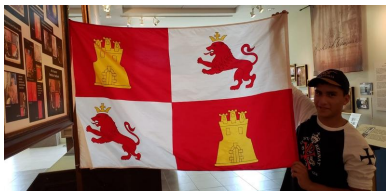
Flag of Catholic Spain

Blessing the Spanish and Indians during the Benediction of the Most Blessed Sacrament.