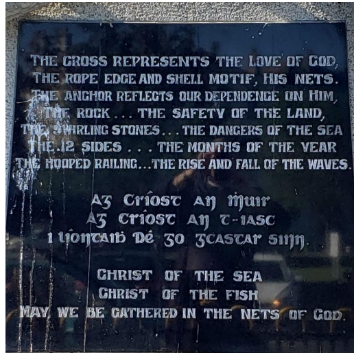
The Cross represents the Love of God, The Rope Edge and Shell Motif, His Nets. The Anchor reflects our dependence on Him, The Rock ...the Safety of the Land, The Sparkling Stones ...the dangers of the Sea, The 12 Sides ...the Months of the Year, The Hooped Railing...the Rise and Fall of the Waves.