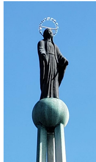
Our Lady guiding ships into Dublin Harbor - The Star of the Sea!