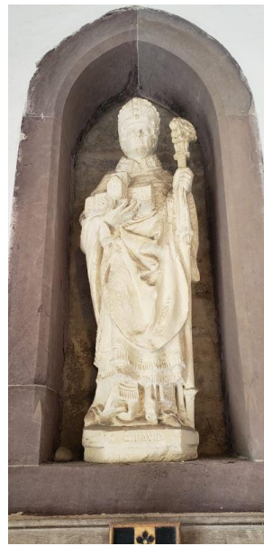
St. David was a 6th Century bishop and is the Patron Saint of Wales. He founded several monasteries in Wales, and fought against the Pelagianism heresy at that time.