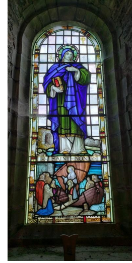
The Chapel of St. Non was built on the site of the birth of St. David.