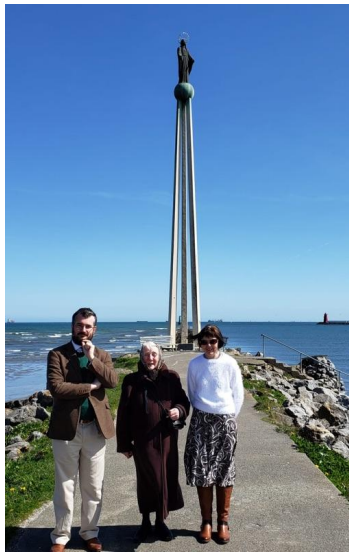
Some of the Resistance Faithful in Dublin Harbor