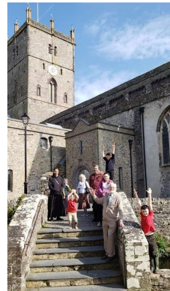
What joy our Catholic heritage brings!