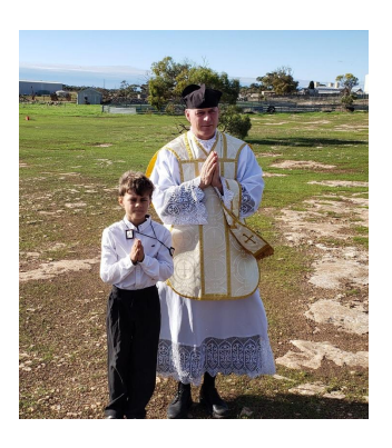
First Holy Communion and Enrollment in Our Lady's Scapular!