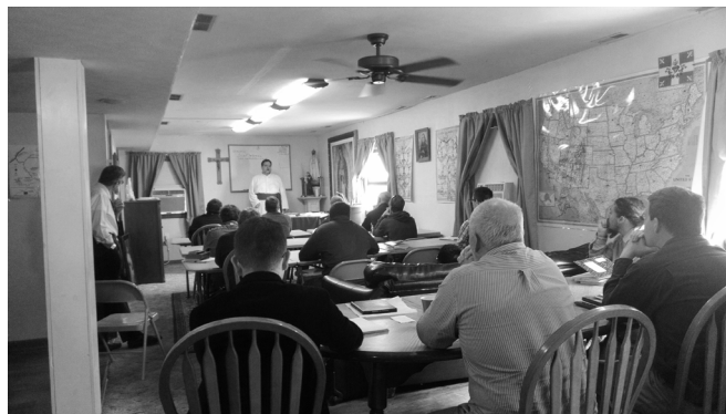
Summer Retreats 2016